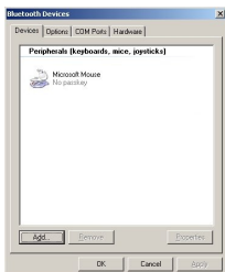
A list of installed Bluetooth devices